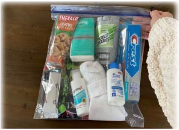
Blessing Bags for Neighbors in Need

The Mission committee is planning a trip to Parking Lot Ministry at the end of May. We are asking the congregation to supply Blessing Bags for Men and Women. There is a list but you can use your imagination as well. These are to be in gallon zip lock bags. We will have examples in the narthex. Presbyterian Women are helping with toilet paper and paper towels. If you have clean used T-shirts and shorts, they also would be helpful. All are invited to come and share in this mission. It is a blessing!